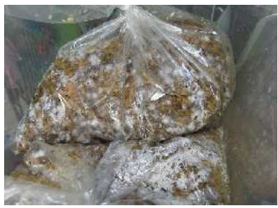
After 24-48hours, you should see small cottonwool-like dots appearing throughout the substrate. The toilet roll substrate is the slowest to grow, due to the lack of mixing of substrate and spawn.